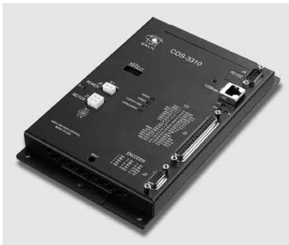
CDS-3310 Single-axis Controller and Drive System

The CDS-3310 incorporates a 32-bit microcomputer and provides such advanced features as PID compensation with velocity and acceleration feedforward, program memory with multitasking for simultaneously running up to eight programs, and uncommitted I/O for synchronizing motion with external events. Modes of motion include point-to-point positioning, jogging, contouring, and electronic gearing.